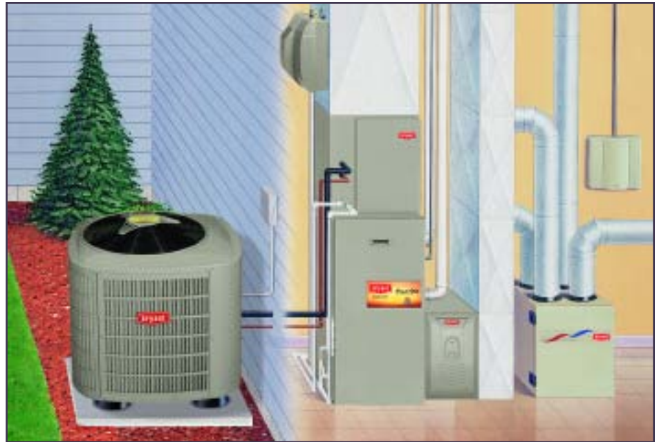
Hybrid Heat™ Deluxe Heat Pump and Deluxe Gas Furnace System

Model 355AAV shown with optional Bryant High Efficiency Media Filter